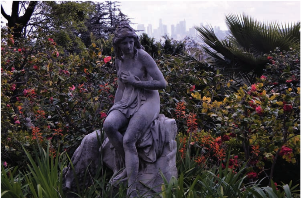
View of Los Angeles