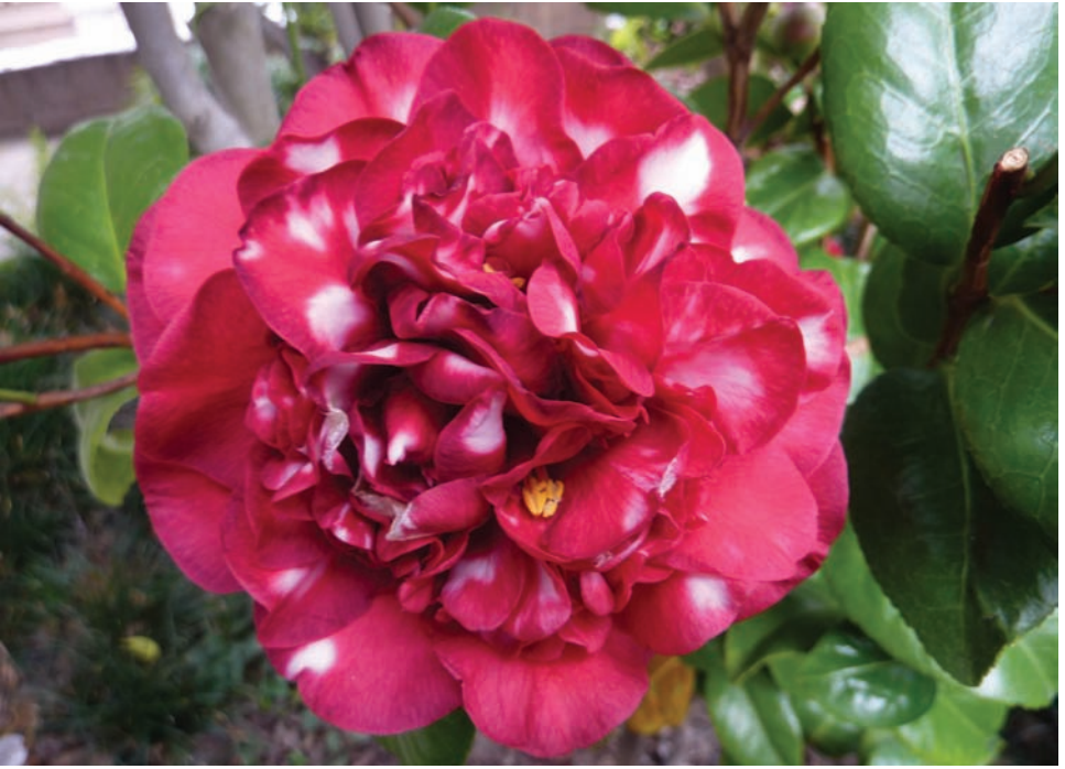
'Bev Piet Smiles'