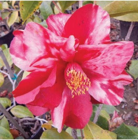
'Julius Nuccio Variegated'