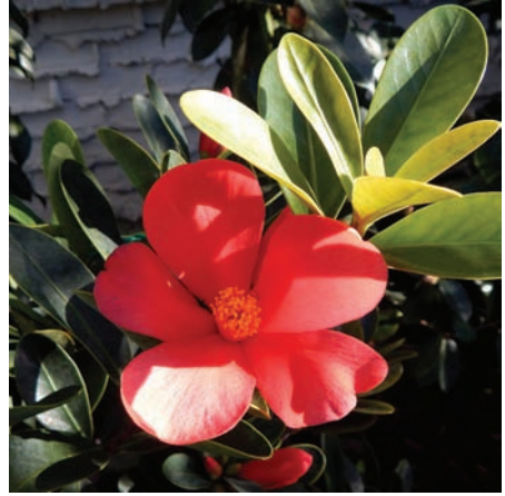
C. azalea showing new growth and bloom in late December