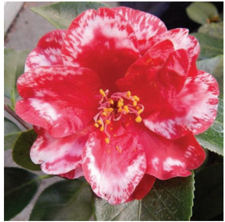
Moiré variegated ‘Red Devil’