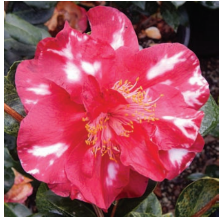
'Bob Hope Var.'