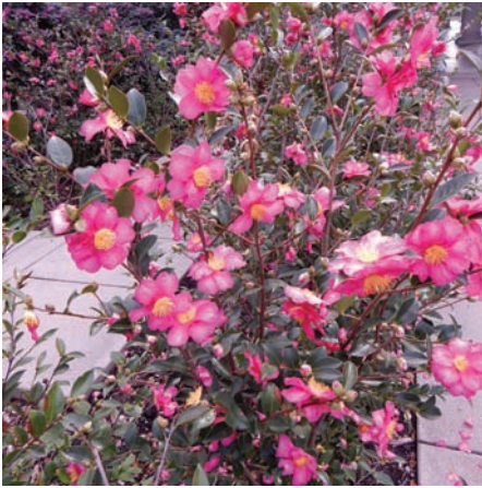
'Kanjiro' bush in bloom