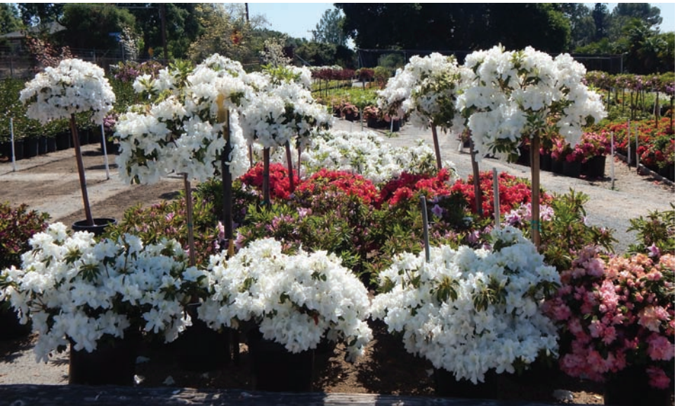
Azaleas at Nuccio's Nursery

Pairing camellias and azaleas in the landscape makes a wonderful combination. The camellias are placed in the back and the azaleas in the foreground. One of the best landscaping designs is to use three tiers - trees, camellias and azaleas. However, creative variations could include upright tall camellias, bushy midsized camellias and then the azaleas. Clustering in groups of three, five and seven is a