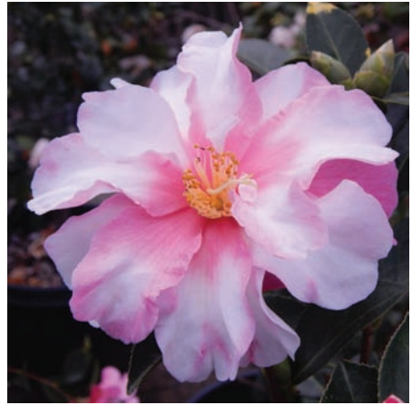
'Lucky Star Variegated'