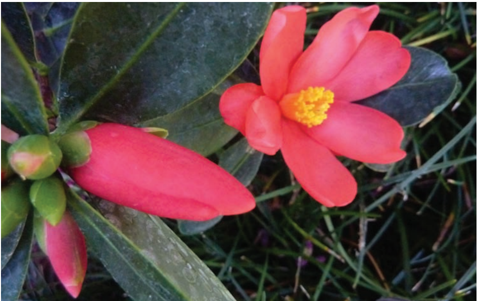
C. azalea with bud, flower and leaves