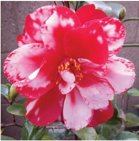
‘Red Devil Variegated’

Finally, after several years seeking to variegate ‘Red Devil’ it seems to be successful. I used ‘Adolphe Audusson Variegated’ as rootstock. What do you think of the results?