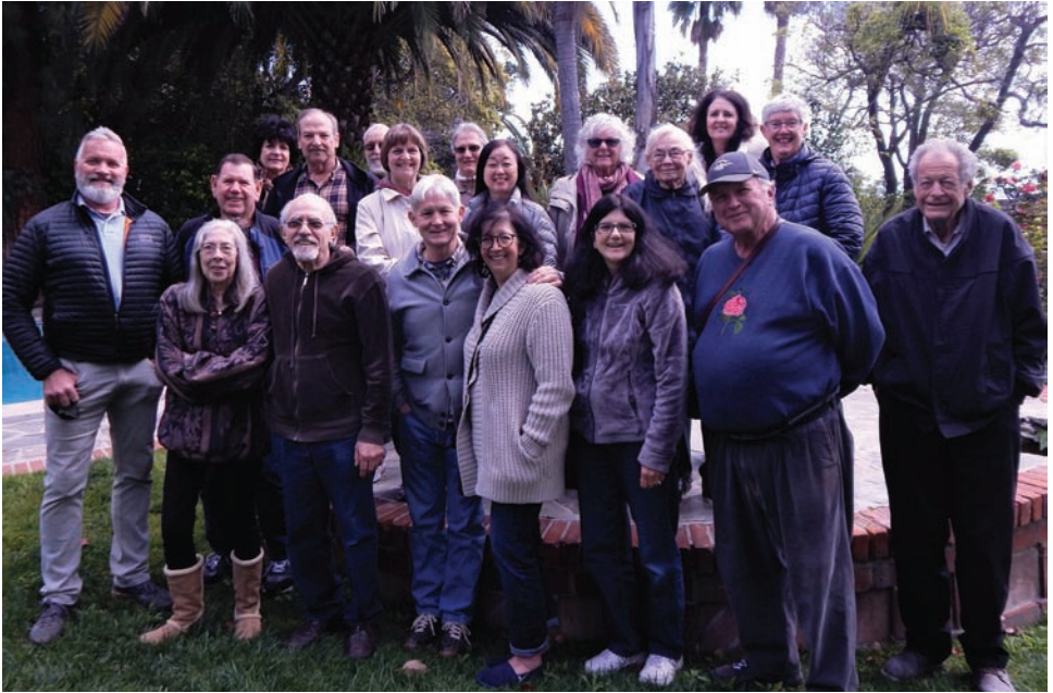
SCCS Group Outing