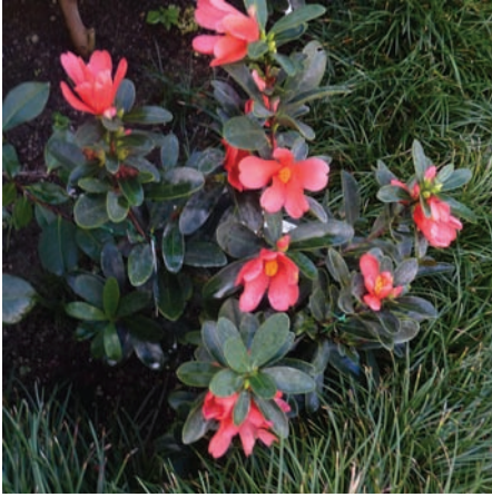
C. azalea in bloom

There is only one camellia that blooms in the summer. It is a C. azalea a species from China that blooms all year long in China. It will have some flowers in Southern California from March through December. It peaks in the hot summer months of July and August and has a smaller flush of flowers again in October. C. azalea has attractive buds and very smooth foliage.