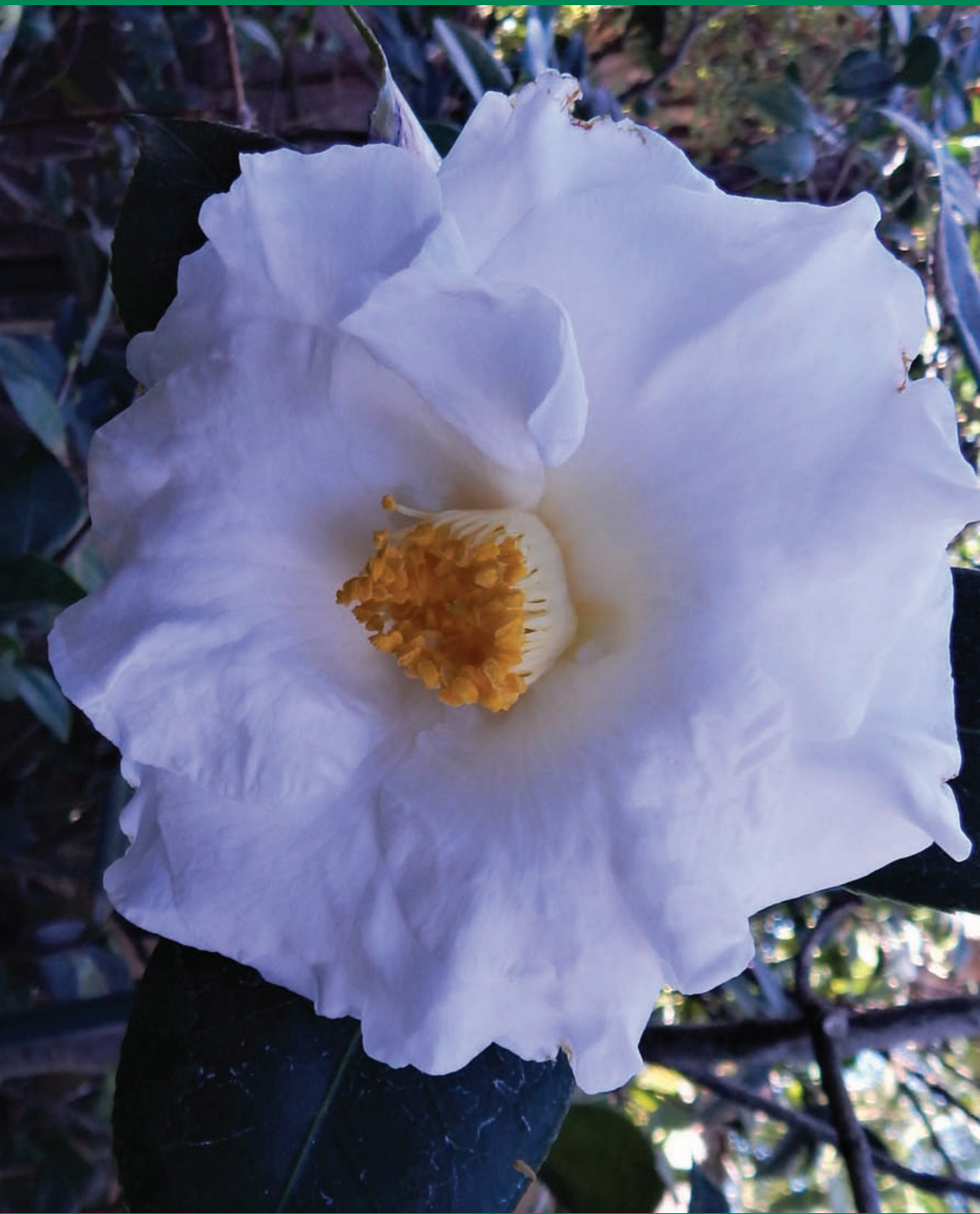
C. japonica 'Tata'