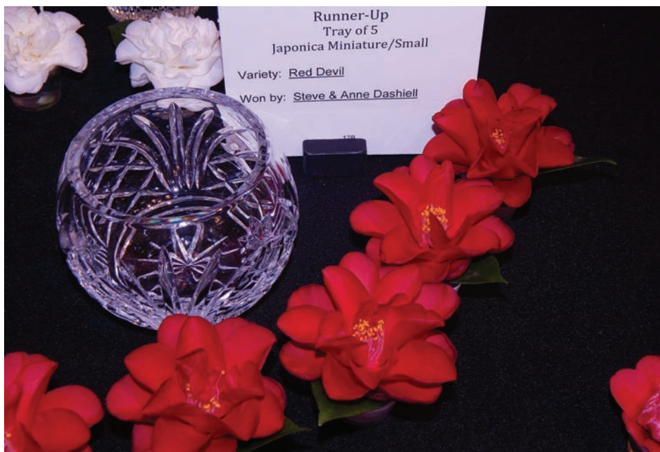
5 winning blooms of 'Red Devil'

The C. japonica 'Red Devil' has a small to medium red semidouble flower. It blooms mid to late season on an upright bushy plant. It is not listed in Nuccio's catalogue but is available for purchase. Therefore, it is grown mainly in Southern California where it competes well in trays of like blooms in camellia shows.